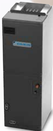
Air Handlers and Coils