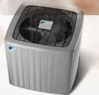
Split System Air Conditioners