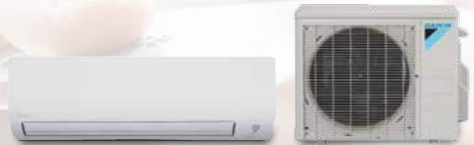
Ductless Mini-Split Systems