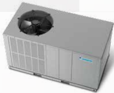
Packaged Air Conditioners and Heat Pumps

Providing energy-efficient performance, proven technology, and enhanced Comfort for Life.