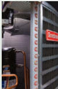
Goodman's SMARTCOIL 5mm tube condensing coil design optimizes the heat transfer ability of R-410A refrigerant compared to standard 3/8" copper tubing.

You can count on your Goodman brand GSX14 Air Conditioner to keep you cool on even the hottest summer days. Your Goodman brand air conditioner starts with an energy-efficient compressor, which operates in tandem with our high-efficiency coil. The coil is made of rifled refrigeration-grade copper tubing and corrugated aluminum fins in a design that maximizes surface area. These high-quality components together cool your home effectively.