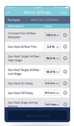
System Pairing Screen