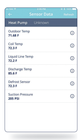
Sensor Data Screen