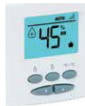
Digital Wall Humdistat