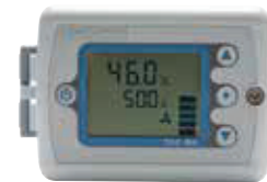
Digital Duct Humdistat