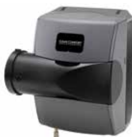
12 and 17 Gallon