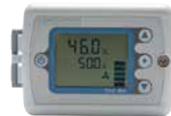
Digital Duct Humidistat