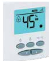
Digital Wall Humidistat