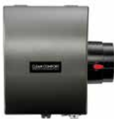
12 and 17 Gallon