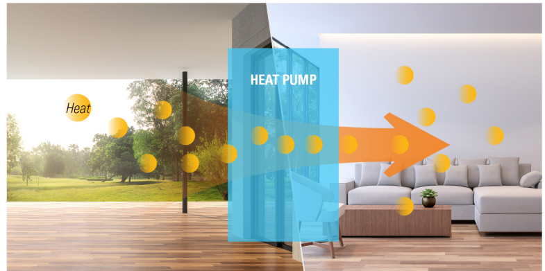
HEAT PUMP HEATING OPERATION VISUAL

The two main components, an indoor, and an outdoor unit, are connected by refrigerant lines and control wiring. The cooling process draws heat from the inside and moves it outside. In the winter, the outdoor unit draws heat energy inside. This operation is more efficient and environmentally friendly since you're not burning fossil fuels. The modern heat pump can also be controlled remotely by an app for maximum convenience.